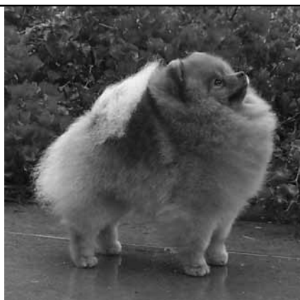
BISS CH. DEE LITTLE WHO'S THE BOSS (MULTI GRP PLACER)