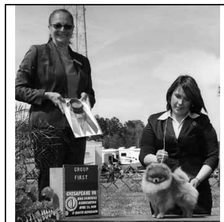
ROCKY WINNING A GROUP 1 FROM THE PUPPY CLASS