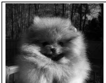
BLOSSOM IS A 2010 HOPEFUL FULL SISTER TO BOSS AND DAISY