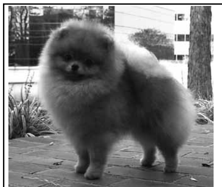
CH. DEE LITTLE BIRDIE TOLD ME ROCKY