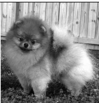
CH. DEE LITTLE DAISY DUKE DAISY & ROCKY FINISHED ON THE SAME DAY WITH MAJORS MAKING THEM MY FIRST BRED BY CHAMPIONS!

save and hand feed die on me. It was the only puppy in the litter and was a section on my girl Faith's very last litter. I was very sad and cried like I usually do for these poor puppies. But