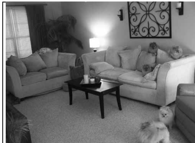
THIS IS THE EVERYDAY LIFE OF MY DOGS FREE TO ROAM MY HOUSE AND TAKE THEIR NAPS OR PLAY