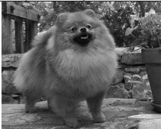
CH. CHRISCENDO COME CLOSER (MULTI BOB WINNER)