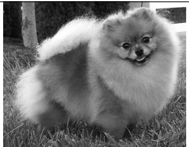
CH. CR CLASSIC LEAP OF FAITH (GROUP PLACER)