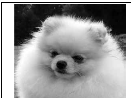
GREAT RIVERS BEAU-TOX IVY WILL BE BRINGING IN QUALITY BLACK AND TAN AND CREAMS