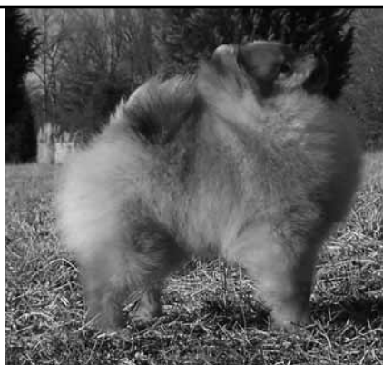
BOSS AT 6 MONTHS OLD I KNEW HE WOULD BE A STAR WITH HIS STUNNING OUTLINE

I am very proud of these wins that I have. I am most proud since they are my dogs that I bred and/or own. I love raising my puppies and training them into show dogs. I have a weakness for rooting for the bred by dogs. I feel a great respect for breeders and what they go through in order to be in that ring on that day showing their dog that they are proud of. This breed is hard to raise puppies, I know. Add into that, having to juggle time to work a full time job, raise a litter of puppies, show on the weekends, and deal with possible sick puppies. It is hard and exhausting at times. I will admit to throwing my hands up in the air and wondering why go on? Well everyone I will give you all a good example of why. . . On Friday I had a 2 week old puppy that I have been trying to